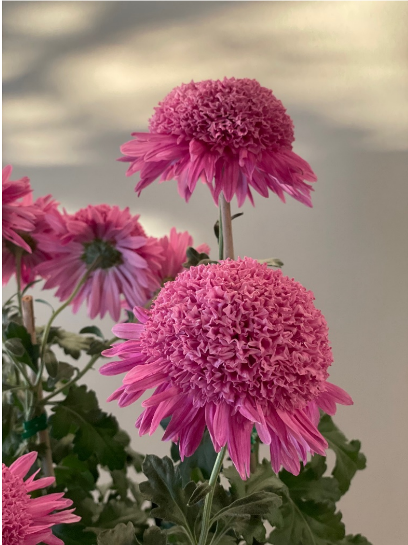
Purple Light, Class 8 Anemone Grower. This photo was taken November 22, 2022.